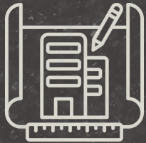
FLAT SLAB STRUCTURAL DESIGN