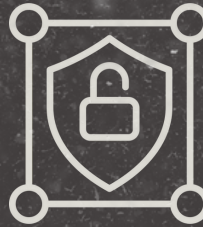
SECURED PERIMETER DESIGN