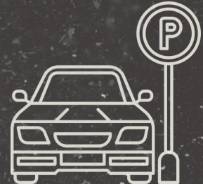
DEDICATED PARKING SPACES