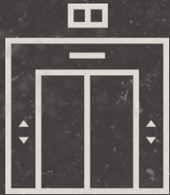
MODERN ELECTRIC ELEVATORS