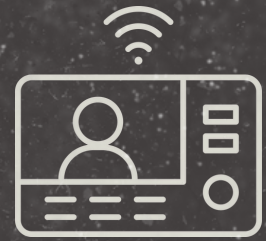
INTEGRATED INTERCOM SYSTEM