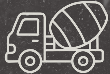
HIGH-QUALITY READY-MIX CONCRETE