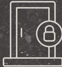
REINFORCED SECURITY DOORS