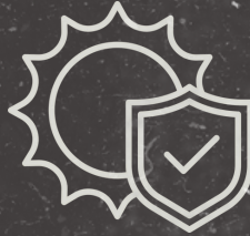
THERMAL-RESISTANT EXTERIOR FINISHES